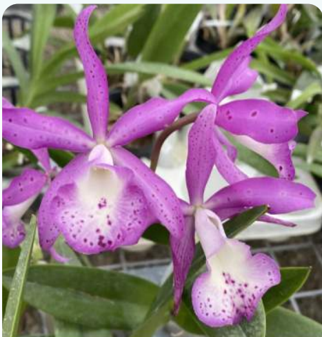
B. Jiminy Cricket' Super Bug HCC/AOS x Netrasiri Beauty