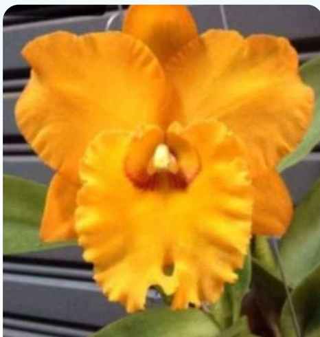
Rlc.Nakornchaisri Delight # 2