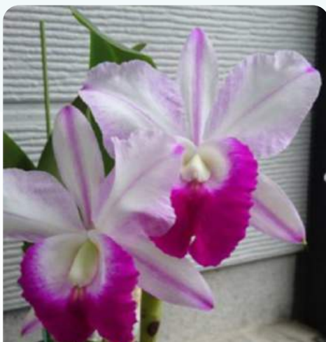
Rlc. Beauty Girl Big Seedling