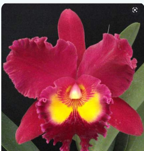
Pot.Chief Sweet Orange" Sweet Orange"