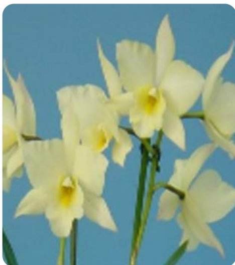
Caulocattleya Millie Bridgewater