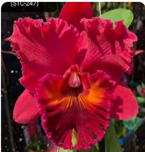
Rlc.Amazing Thailand Riainbow