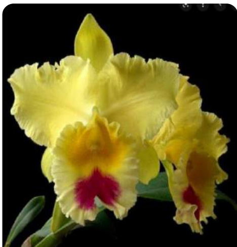
Iwan.Apple Bloossum Hihimanu"